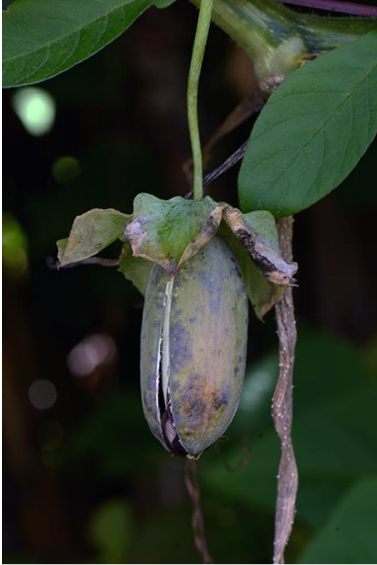
Capsule of Cobaea scandens , photo by P. Acevedo.

with regular anatomy (Figure 200A) or with phloem wedges. Leaves alternate, pari-pinnately compound; leaflets 3–5 pairs, opposite, subopposite or less often alternate, chartaceous to coriaceous, pinnately veined, with undulate margins, commonly asymmetrical at base and petiolulate; rachis canaliculate, with distal portion along with distal leaflets modified into bifurcate tendrils that are either prehensile or act as hooks and help anchoring the plant to the host. Inflorescence axillary dichasial cymes, pendulous or erect, or flowers solitary; pedicels 10–28 cm long. Sepals free, large, green; corolla commonly yellow with purplish or pink