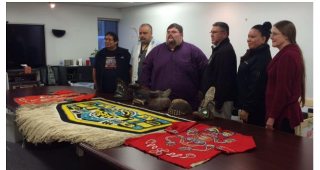
Respective members of the associated clans and Central Council staff preparing to ceremonially acknowledge their "At.óow," and officially documenting their ancestors' return for posterity.