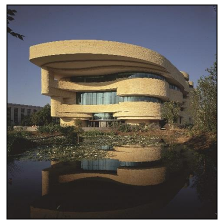
National Museum of the American Indian