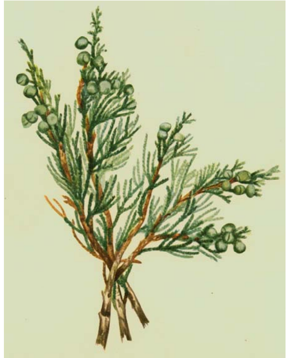
Juniperus horizontalis , Walcott's North American Wild Flowers, 1925

Lewis collected and mentioned other plants with medicinal virtues. Some of them are in the Lewis Herbarium, such as Pediomelum argophyllum (Pursh) J.Grimes, silverleaf Indian breadroot, used to treat inflamed eyes; Juniperus horizontalis Moench, creeping juniper, used to make tea to produce sweat; Hydrastis canadensis L., goldenseal, used as a remedy for an illness called 'soar eyes'. Click on these links to access the plant pages in the "Lewis and Clark as Naturalists" website.