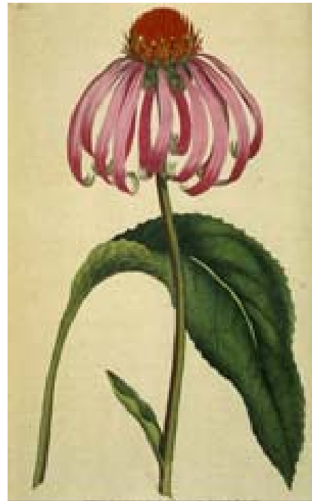
Echinacea purpurea Curtis Botanical Magazine Pl.5281

Lewis’ genuine interest in identifying plants with potential medicinal uses reflects the high esteem East Coast Americans had for Native American cures. Scientists like Benjamin Smith Barton, Lewis’ mentor in botanical science, and Dr. Benjamin Rush, a noted doctor who advised the Expedition on medical matters, believed that North American Indians had discovered precious curative plants unknown to European medicine (Gilman 2003:267). This appreciation for Indian medicine makes sense in the light of the poor state of European medicine at the turn of the 19 th century and the role played by natural medications and folk remedies. Lewis’ well-stocked medicine