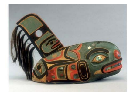
Congressional Gold Medal honoring Tlingit World War II code talkers featuring an image of Killer Whale hat and the original Killer Whale hat.